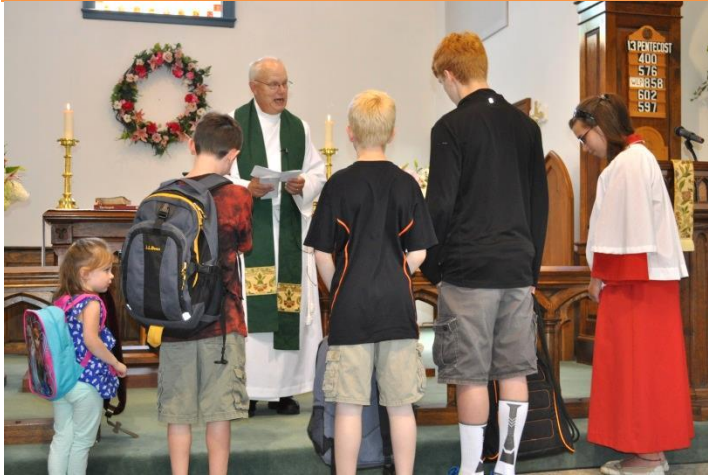
Back to School: Blessing of the Backpacks